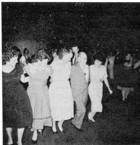
One of the recent, very successful Chicago Socials