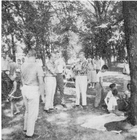
NORTH AURORA PARK

All who came spent a joyful day playing together and can look forward to another picnic next year.